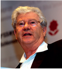
Dr. Aharon Barak

Professor, Member of the Israeli National Academy of Science and the Accademia Nazionale dei Lincei in Italy, foreign honorary member of the American Academy of Arts and Sciences